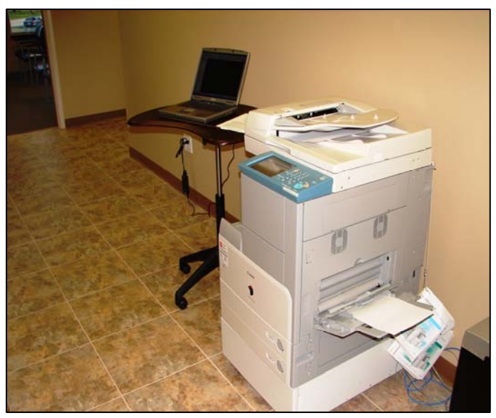
↑ Main Hallway of Office ( Pictured Above ) ↑ ↓ Trustee Workstation ( Picture Below ) ↓

Wireless capabilities were added to our computer system to allow us to scan & safeguard documents in our network.